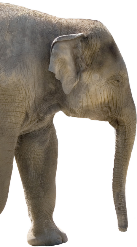
Figure 1: Monitoring the Wealth & Health of Populations using the Living Planet Index (LPI)